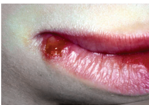
Herpes - refer to dentist if it doesn't heal in 7-10 days