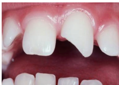
Tooth fracture - refer