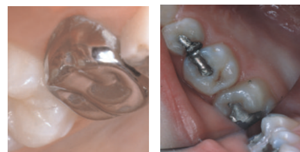
Stainless steel crown