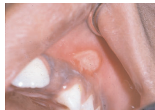
Aphthous Ulcer - refer to dentist if it doesn't heal in 7-10 days