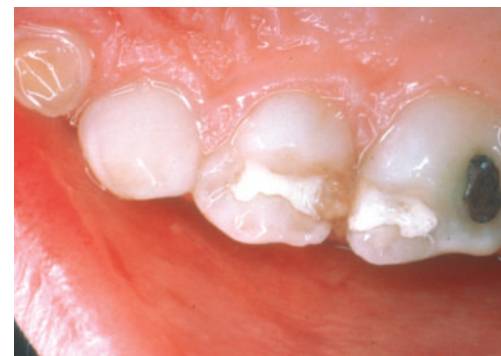
Temporary filling- refer to dentist if there is no follow-up scheduled