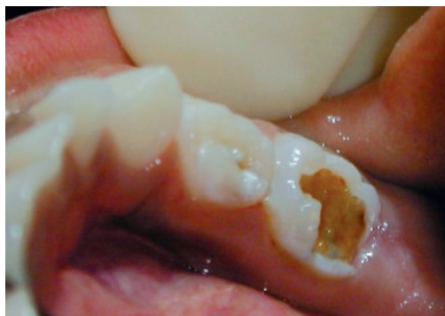
Cavity - large