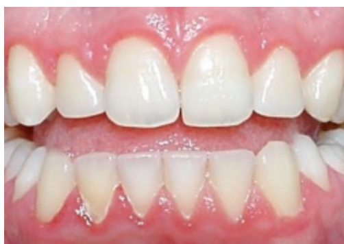
Gingivitis- discuss toothbrushing 2-3 times a day and recheck in a couple weeks