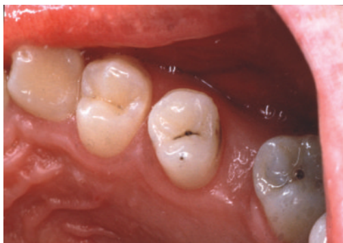
Pit & fissure cavity - small