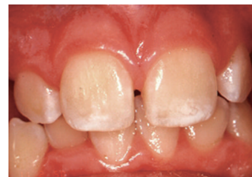
Fluorosis - do not refer