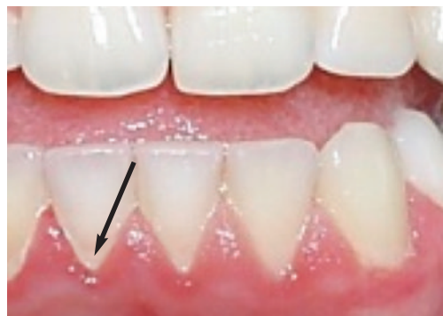
Plaque on teeth - do not refer